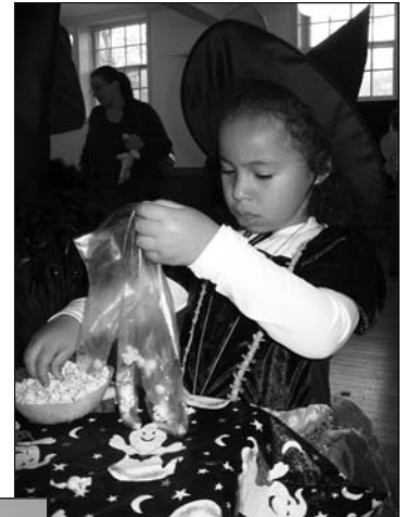
A friendly witch makes a craft